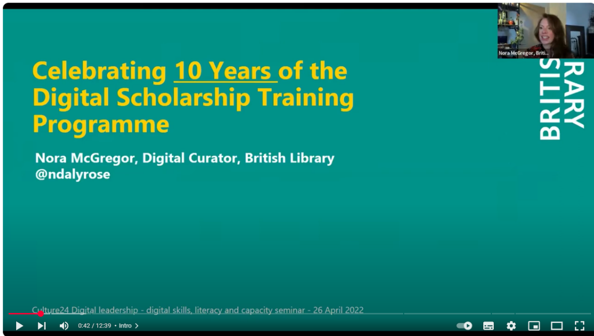
Figure 2: Watch the video

In this short video from a Culture24 Digital Leaders - digital skills, literacy and capacity online seminar, I talk about inspiring and supporting team members from The British Library to pursue digital skills and literacy development through their Digital Scholarship Staff Training Programme.